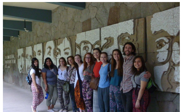
UNIVERSITY OF CENTRAL AMERICA