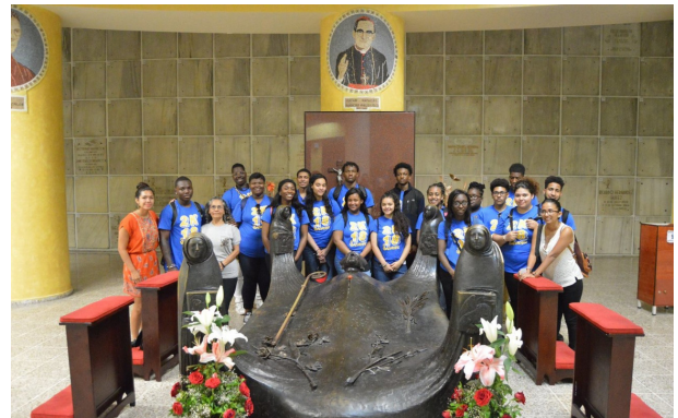
CRYPT OF MONSIGNOR ROMERO