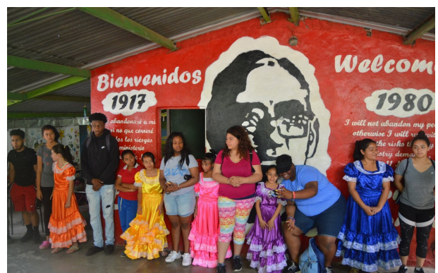
PATRONATO LIDIA COGGIOLA