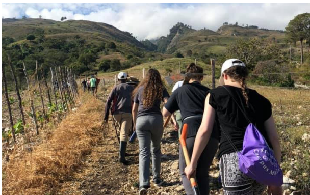
SUSTAINABLE AGRICULTURE PROJECT