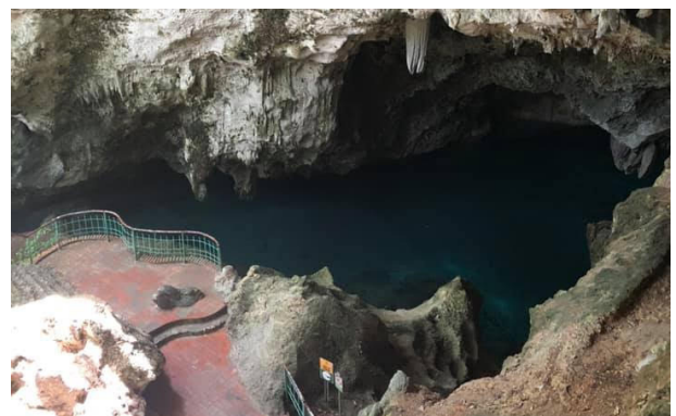
THREE EYES CAVES