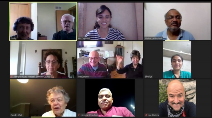
Participants during IPM's new Virtual Immersion Experience (VIEP) in India, March 2021

In September 2020, IPM was thrilled to debut a brand new Virtual Immersion Experience Program (VIEP) created to supplement and enhance our existing in-person programming that the pandemic has currently placed on hold.